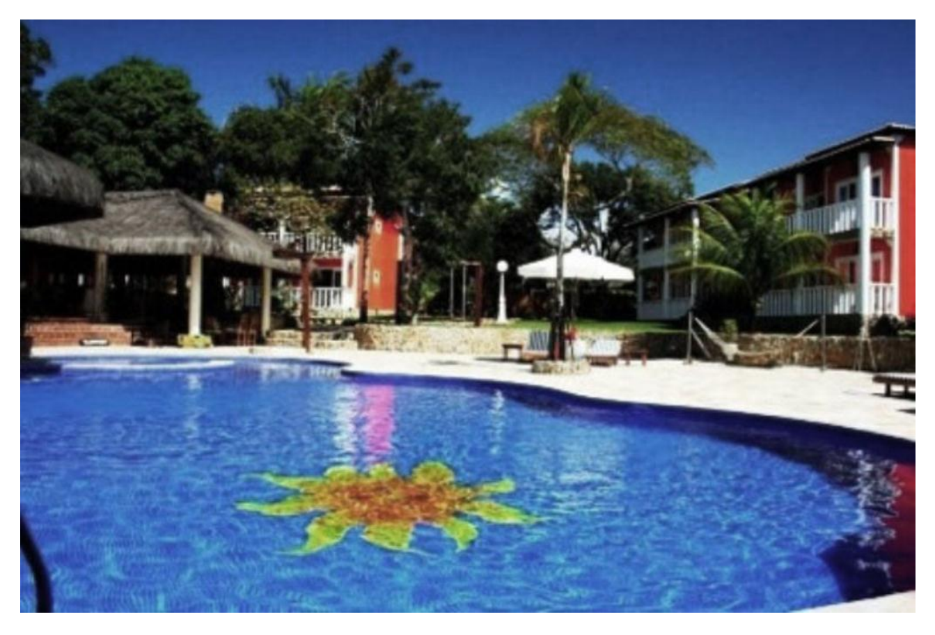
Situated in <u>Porto Seguro</u>, a rapidly developing city in the south of Bahia, the Xurupita resort offers a fantastic investment opportunity.

Xurupita is a luxury hotel, spa and exclusive residential development, constructed with a spectacular attention to detail.